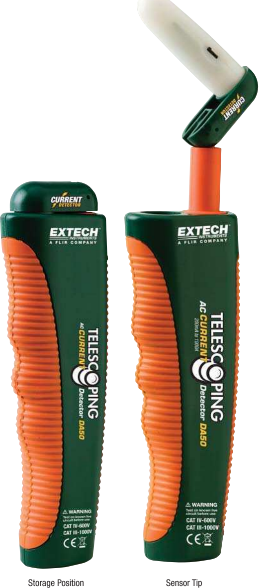
Probe extends 36" (0.9m) allowing 39" (1m) total reach